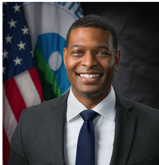
Administrator Michael S. Regan